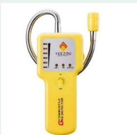
Gas Leak Testing

We include Air Quality Testing, Carbon Monoxide Testing, Moisture Testing, Radon Testing, and we use Infrared Technology.